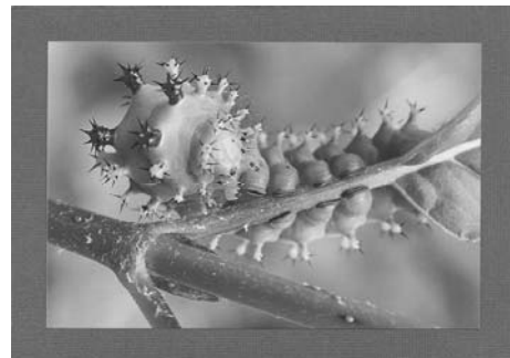
Giant silkworm caterpillar

We also received a holiday donation from a young fan of the Keene Public Library: